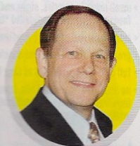
MAYOR FRANCIS SLAY