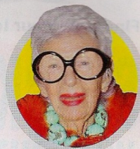
IRIS APFEL Honoree

Guests at the Saint Louis Fashion Fund Gala included designers, fashion editors, and style aficionados.